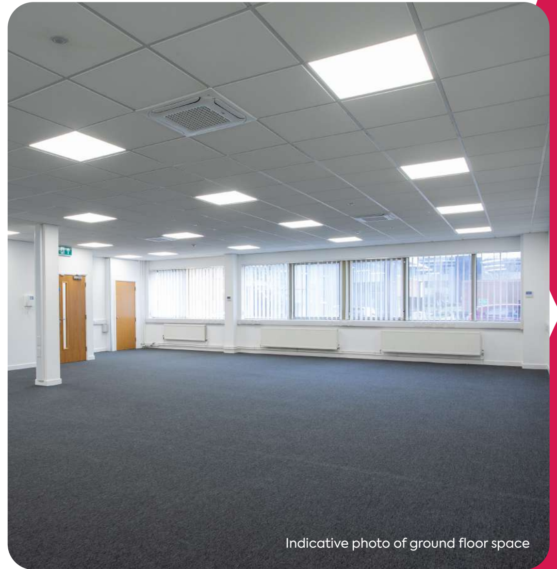
Indicative photo of ground floor space